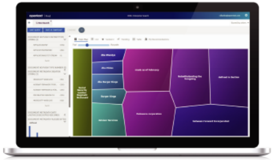
Figure 4 Multi Document Type Tagging