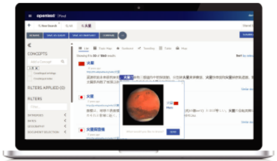
Figure 3 Multilingual Support within the Find UI