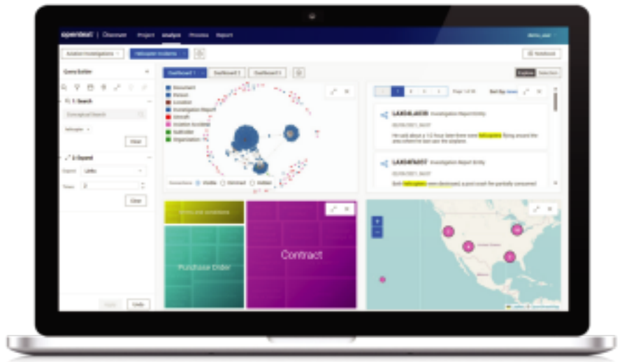
Figure 1 Discover UI showing rich analytics