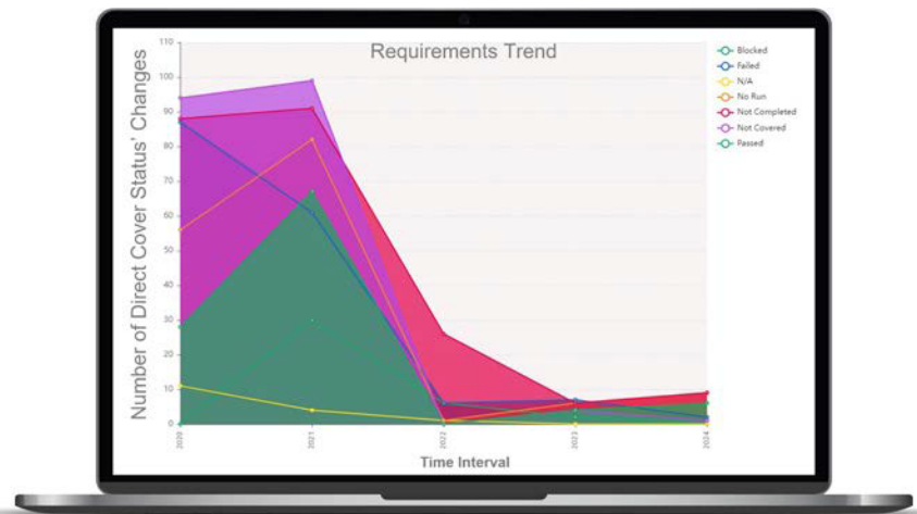
Example of OpenText Application Quality Management reporting